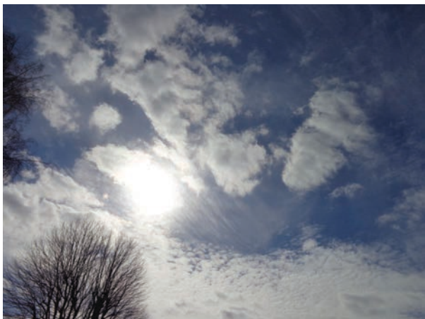
James Ward Digital photography learner 2013/14